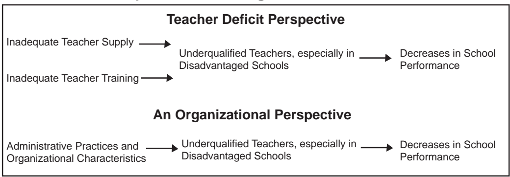
Figure 1. Two Perspectives on the Causes and Consequences of Underqualified Teaching

especially those with a conservative political orientation, have argued that incompetent and corrupt school managers are a major factor in the plight of low-income, innercity public schools. Liberal-left critics have forcefully responded that this viewpoint unfairly places responsibility for the problems of low-performing schools on the victims of these same problems and unfairly shifts responsibility away from systemic inequities in funding and resources embedded in the larger educational or socioeconomic system (e.g., Kozol, 1991).